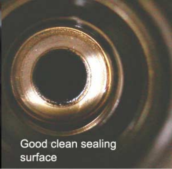
Good clean sealing surface