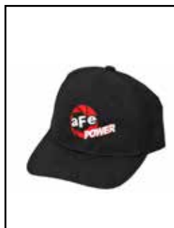
aFe Power Hat