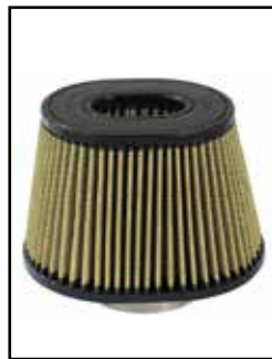
Pro GUARD Air Filter