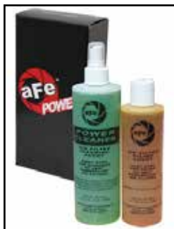
Gold Squeeze Restore Kit