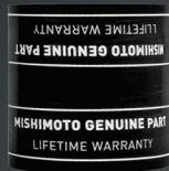
2008—2010 FORD 6.4L POWERSTROKE FACTORY-FIT COLD-SIDE UPPER BOOT MODEL: MMBK-F2D-08CU