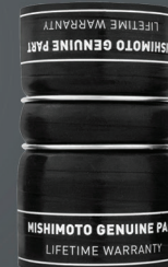
2008—2010 FORD 6.4L POWERSTROKE FACTORY-FIT HOT-SIDE LOWER BOOT MODEL: MMBK-F2D-08HL