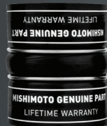
2008—2010 FORD 6.4L POWERSTROKE FACTORY-FIT COLD-SIDE LOWER BOOT MODEL: MMBK-F2D-08CL