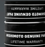
2008—2010 FORD 6.4L POWERSTROKE FACTORY-FIT HOT-SIDE UPPER BOOT MODEL: MMBK-F2D-08HU