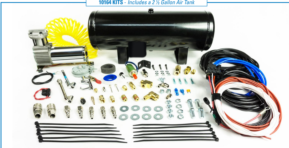
10164 KITS - Includes a 2 ½ Gallon Air Tank

This kit contains push-to-connect fittings; using scissors or wire cutters to cut the nylon airline will distort the line and cause the connection to leak. THE AIRLINE MUST BE CUT OFF SQUARELY WITH THE NYLON HOSE CUTTER PROVIDED IN THIS KIT OR A SHARP UTILITY KNIFE.