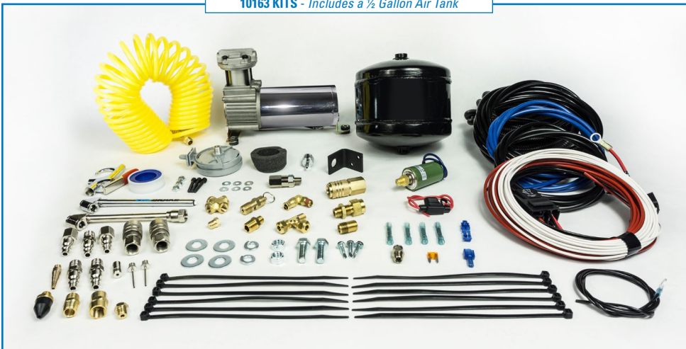
10163 KITS - Includes a ½ Gallon Air Tank