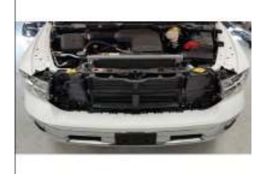
Figure 7 - After

8. <u>For HD install only:</u> Using a file or a Dremel Tool, widen the lower tab receiving hole to 13/16". (Refer to Figure 8)