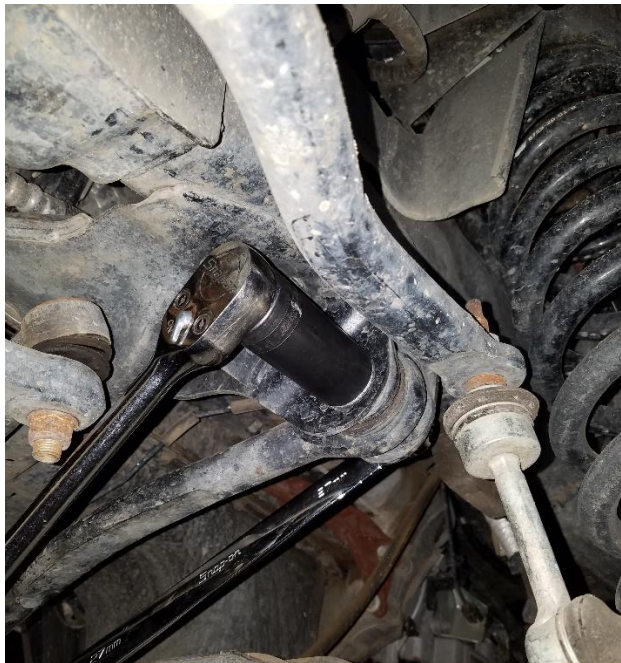
Figure 3. Unbolting the Frame Side of the Front Track Bar