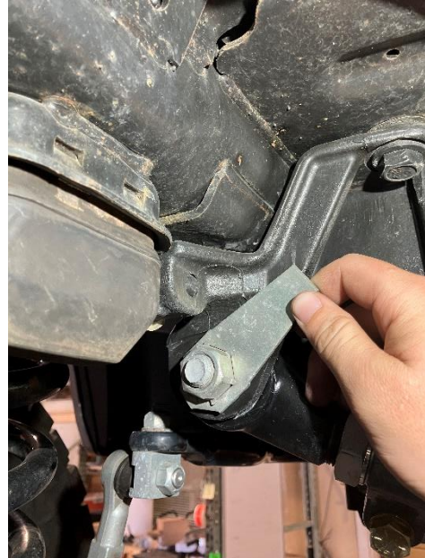
Figure 7. Installing the Frame Side Nut

7. Torque the track bar bolts to OEM specifications, see Figures 8 and 9 :