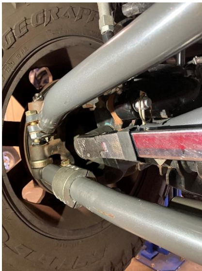
Figure 8. Torqueing Axle Side Bolt