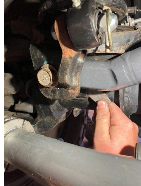
Figure 5. Holding the Flag Nut for Assembly