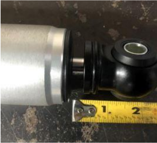
Figure 6. Compressed Steering Stabilizer