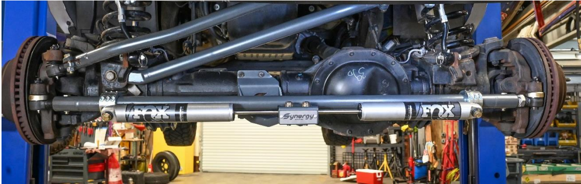
Figure 9. Dual Steering Stabilizers Installed on Dual Stabilizer Bracket