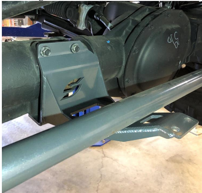
Figure 3. Dual Stabilizer Bracket Indexed on the Differential Housing