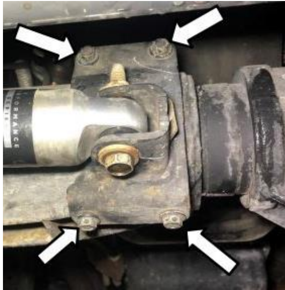
Figure 2. Bolts to Remove Factory Stabilizer Mount