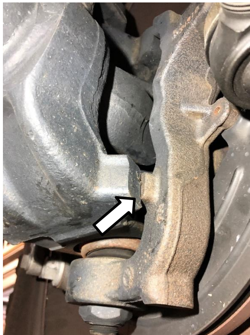
Figure 5. Driver Side Knuckle Fully Turned to the Passenger Side, Contacting the Steering Stop