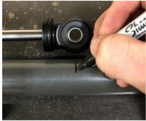
Figure 7. Marking the Mount Centerline