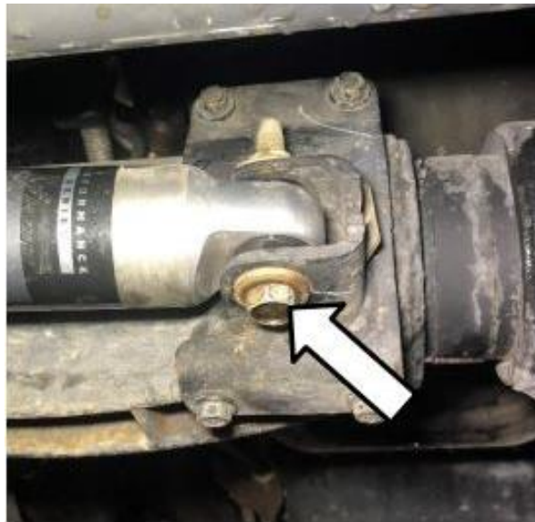
Figure 1. Stabilizer Bolt to be Removed