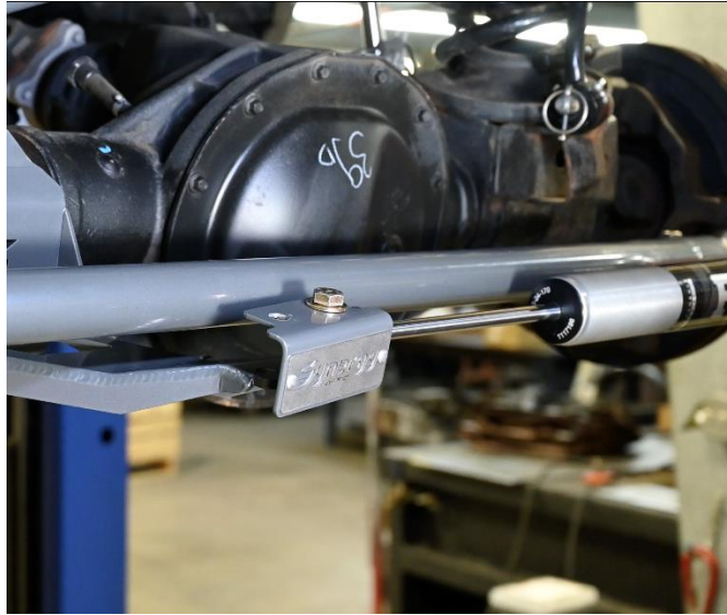
Figure 4. Partially Installed Stabilizer on Synergy MFG Bracket