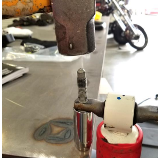
Figure 1: Remove OEM Studs.