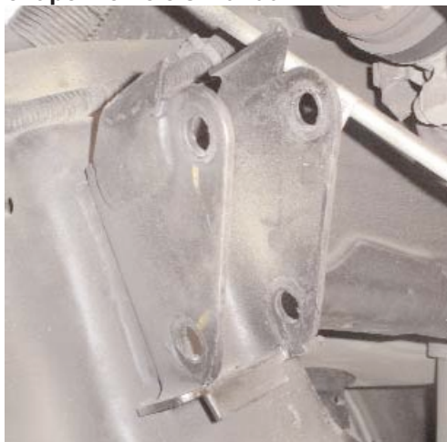
FIGURE B – Cut Brace