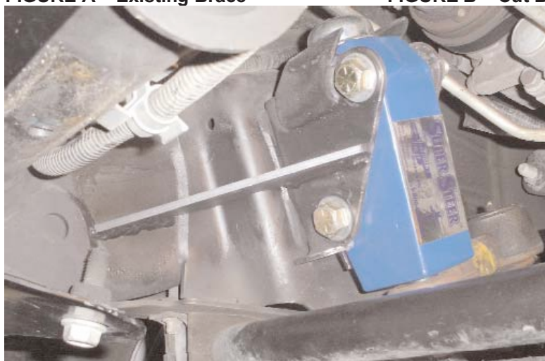
FIGURE C - Gusset welded in center of brace; SS175 installed.