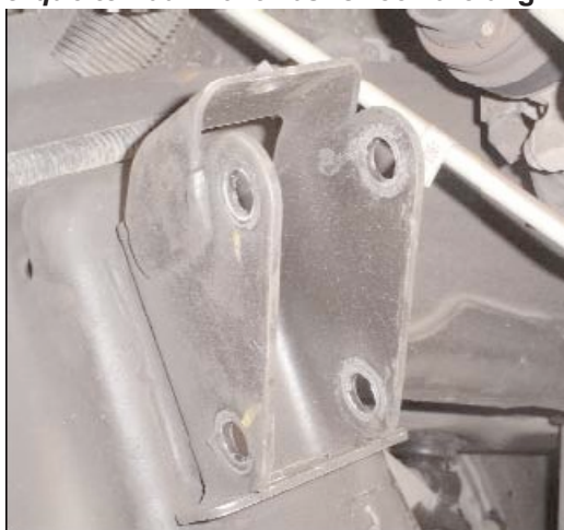
FIGURE A – Existing Brace