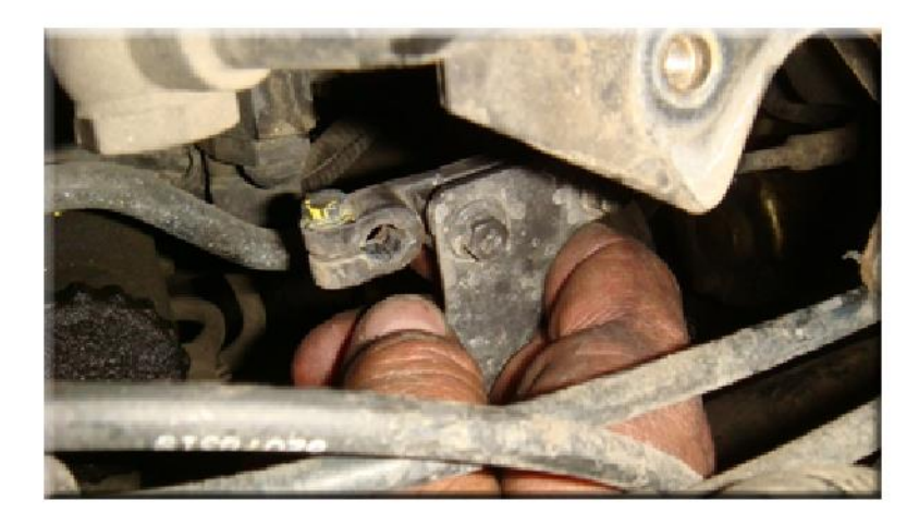
*NOTE* - Do not lose the Woodruff key located in the shaft.